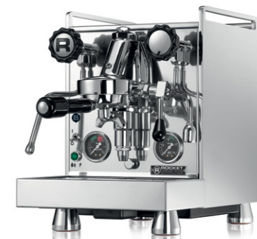
MOZZAFIATO CRONOMETRO R