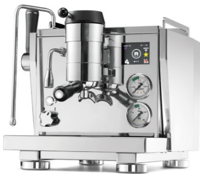
R NINE ONE