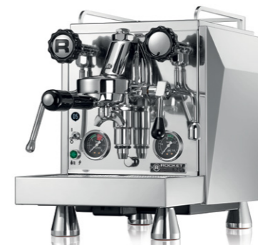
GIOTTO CRONOMETRO R