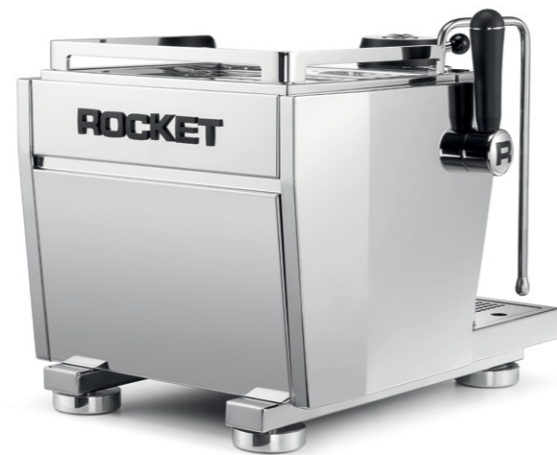
Dual Boiler technology + saturated group + pump pressure profiling