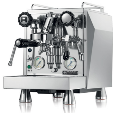
GIOTTO CRONOMETRO V