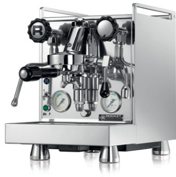
MOZZAFIATO CRONOMETRO V